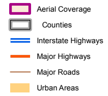
Image Date: April 2009 Ground Resolution: 30 cm Square Kilometers: 655